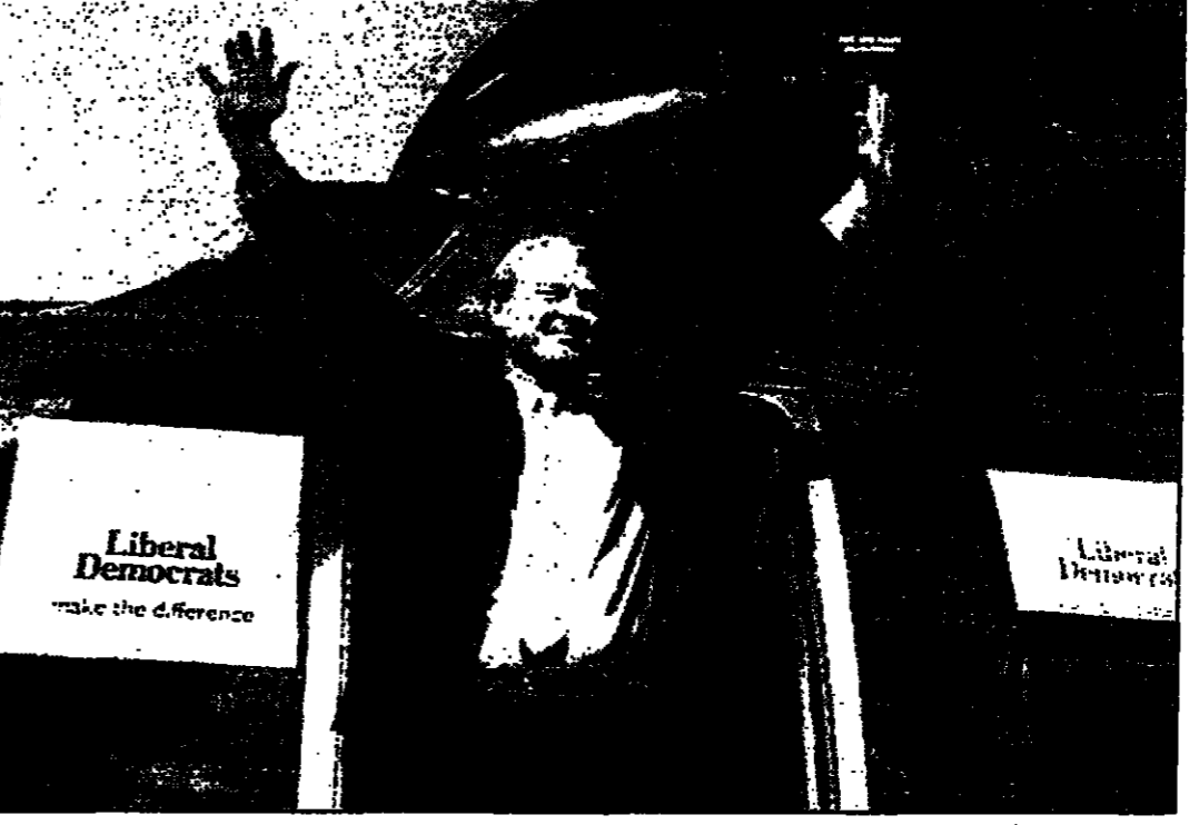
Paddy Ashdown, leader of the Liberal Democrats, waves to supporters from his helicopter on a campaign stop in Sutton, a London suburb, yesterday.

Pundits tip Adams as front runner to regain the parliamentary seat he lost in 1992, after holding it since 1983. Britain says that whether or not Adams wins a seat in parliament, he will remain barred from peace negotiations until the IRA renounces violence.